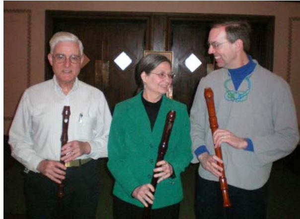
Making Fantastic Music!!!