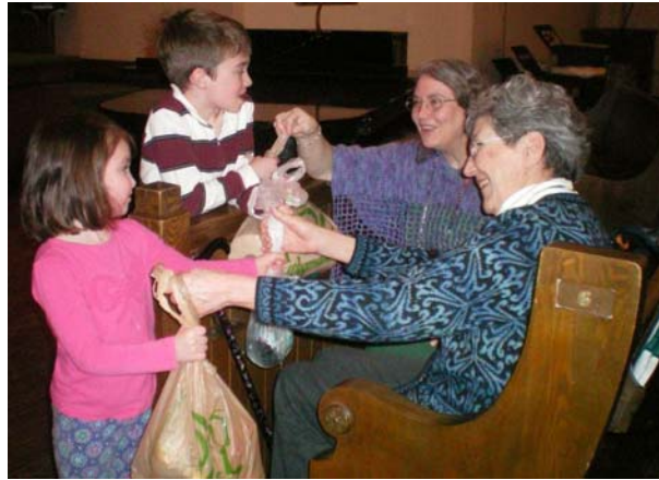
Social Justice in our community