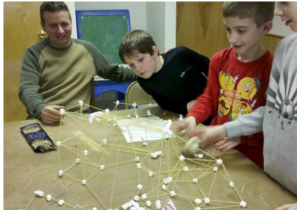
Fun at Religious Education

Gather the spirit, harvest the power! Our separate fires will kindle one flame.